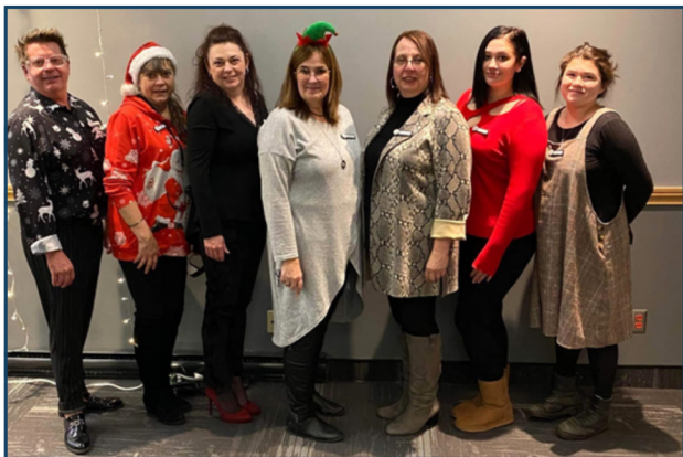
Neighbours Staff 2022 © Shannon Caprio

Anything with cheese on it breaks my will power, but my favourite meal is one shared with good friends!