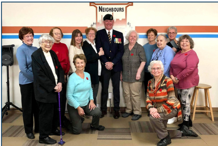
Remembrance Session

Our openness and diversity. Rouyn-Noranda and other cities in AT are urban-type cities in a rural region. This gives us a unique reality and mixture of experiences!