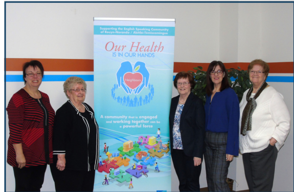
Neighbours Health Committee

Our governance is quite different from other regional associations. Neighbours' board of directors is very hands-on; we have active volunteers who work alongside Neighbours staff as extra hands or advisors. This is a wonderful way to stay grounded and remain grassroots!