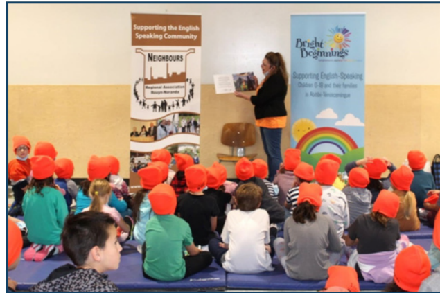
Neighbours Every Child Matters Orange Toques

As a regional organization, we honestly cannot say we have only one focus. We are the one-stop-do-it-all of every non-French-speaking Québécois of Abitibi-Témiscamingue, no matter the issue, topic, or situation! We annually set priorities based on data and consultations, but our focus has to remain broad to service everyone.