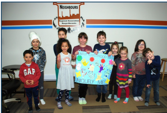
Youth Activity