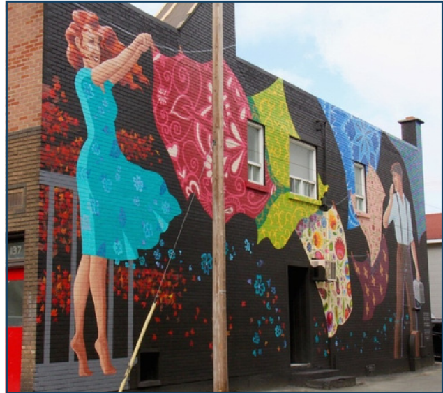
From There to Here Mural

I am a bit of a political junkie, so defending our right to access services is always a little thrill for me. But I think hearing and seeing our community enjoying life, thriving, and being active is the most rewarding! A lot of what we do is behind the scenes, but the results are within the community.